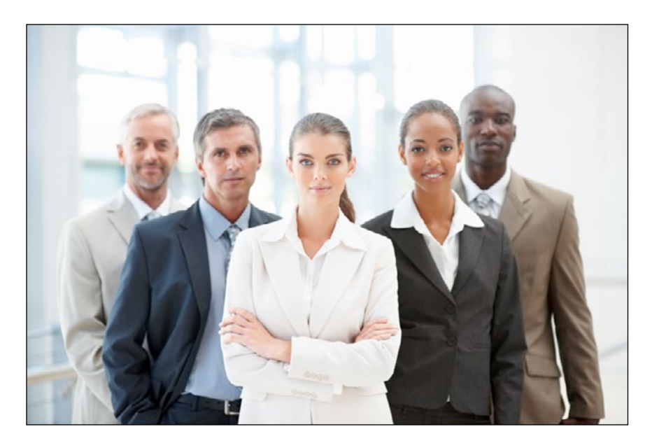
Executives / Professionals